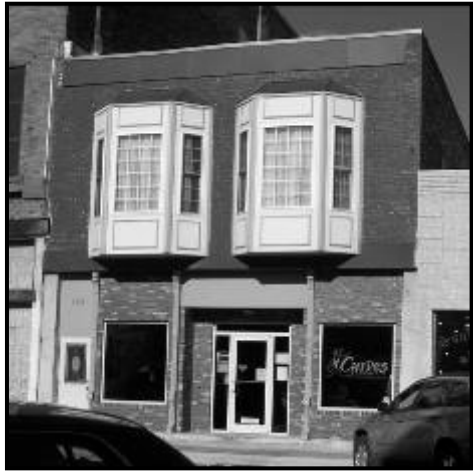
CURVES FOR WOMEN – 124 W. Sale St. Since July 2002