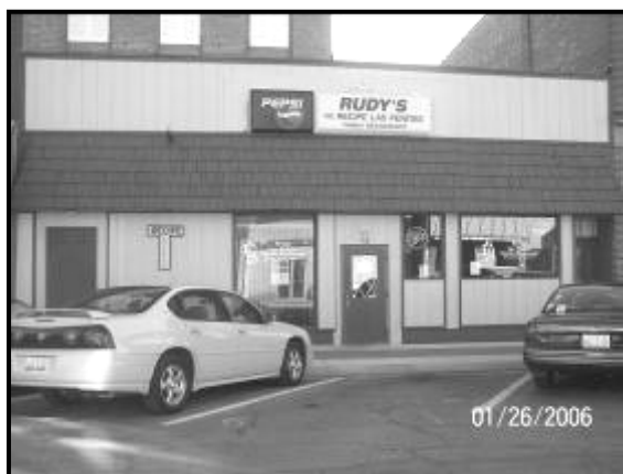
THE RECIPE LAS PENITAS RESTAURANT AND LOUNGE 125 W. Sale St.