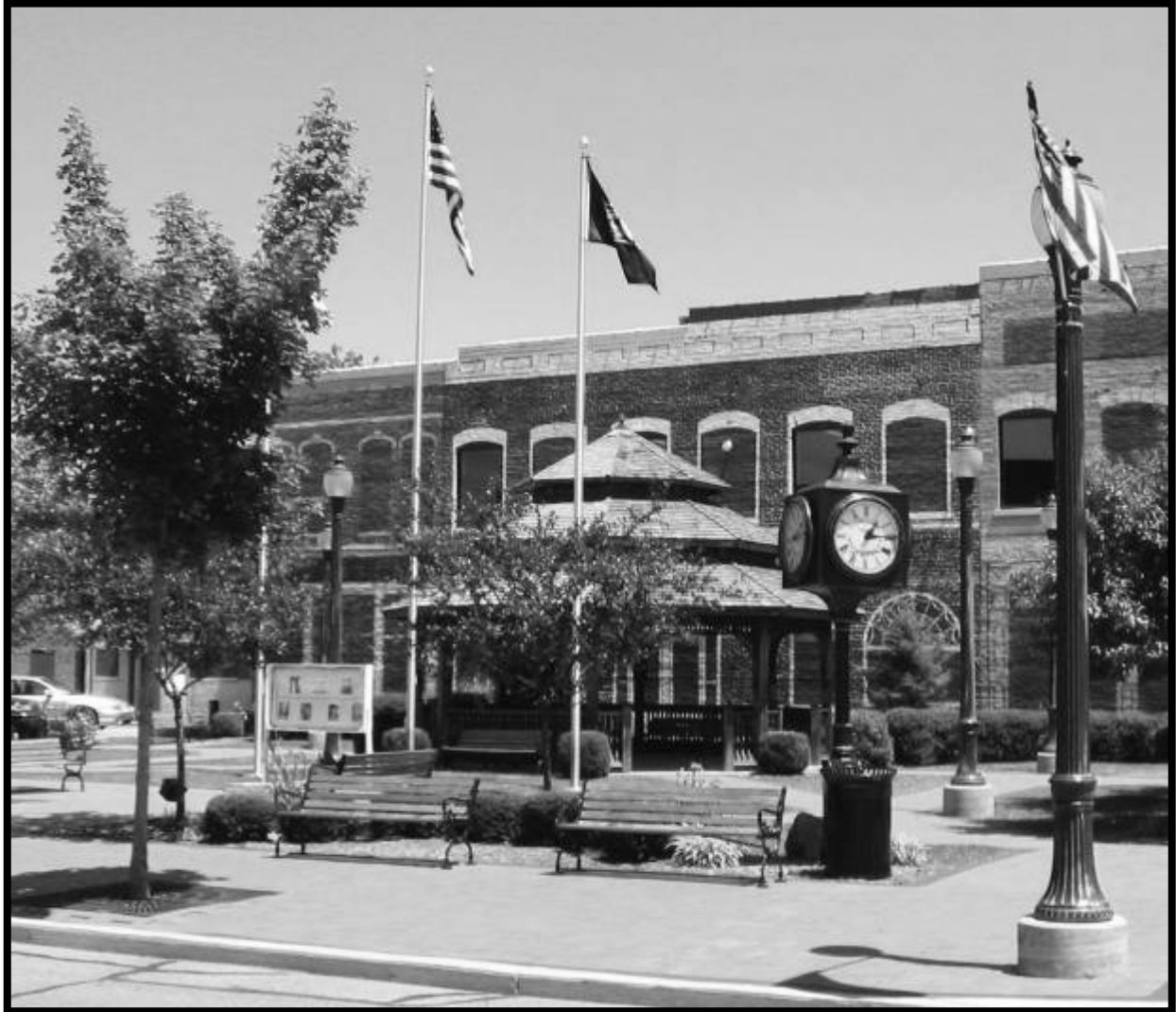
Festival Corner – Main and Sale Streets