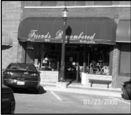
FRIENDS REMEMBERED GIFT SHOP 110 W. Sale St