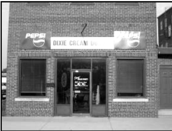
DIXIE CREAM DONUT SHOP 211 N. Parke St. Since 1971