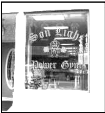
SON LIGHT POWER GYM – 122 W. Sale