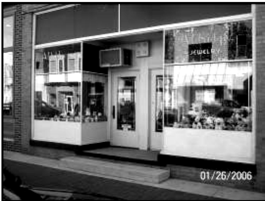
ALDRIDGES NOVELTIES 131 W. Sale St.