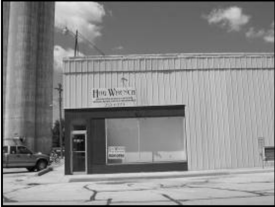
HOG WRENCH 200 N. Parke St. Motor Cycle Repair and Service