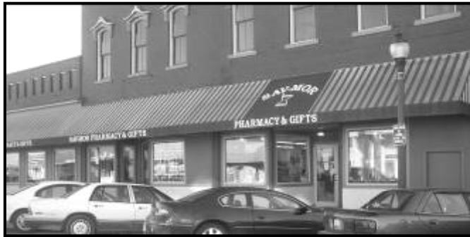
SAV-MOR PHARMACY AND GIFT SHOP 123 W. Sale St.