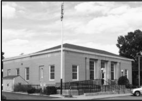
UNITED STATES POST OFFICE 120 E. Sale Street