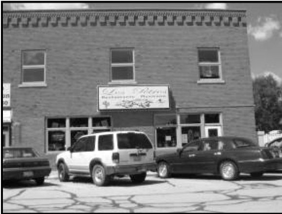
LOS POSTROS Restaurant 208 N. Parke