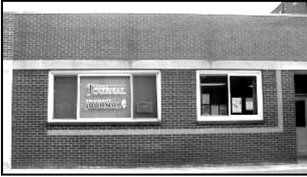
TUSCOLA JOURNAL 115 W. Sale St.