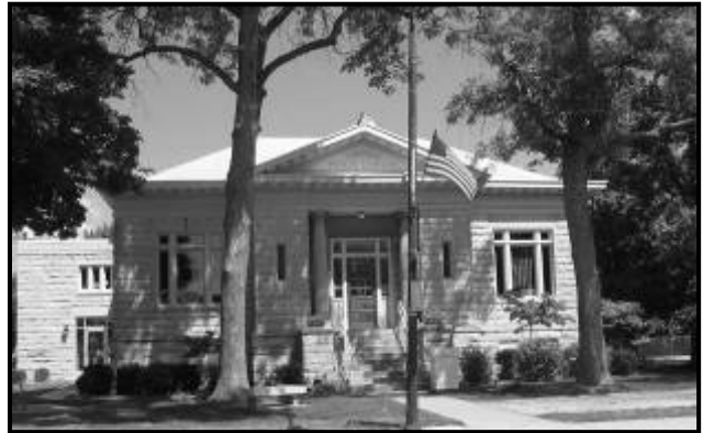
TUSCOLA PUBLIC LIBRARY 112 E. Sale St.