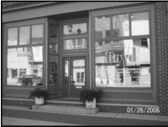
AMERICAN FAMILY INSURANCE 129 W. Sale St. BOYD REAL ESTATE – 129 W. Sale