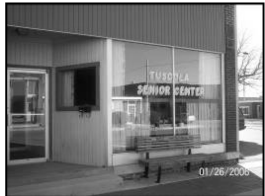
TUSCOLA SENIOR CENTER 133 W. Sale St.