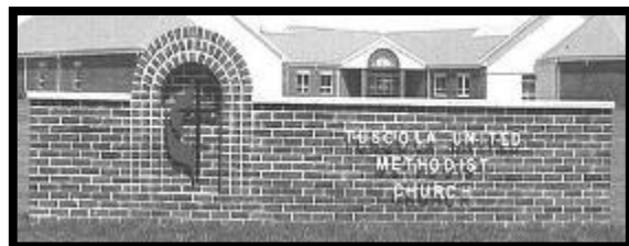
Dedicated Mother's Day May 13, 2001