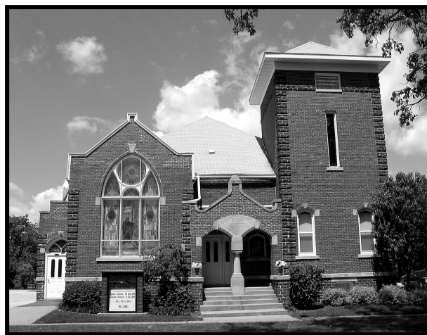
One Hundredth Anniversary 1906 - 2006