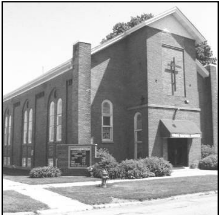
FIRST BAPTIST CHURCH - 2006