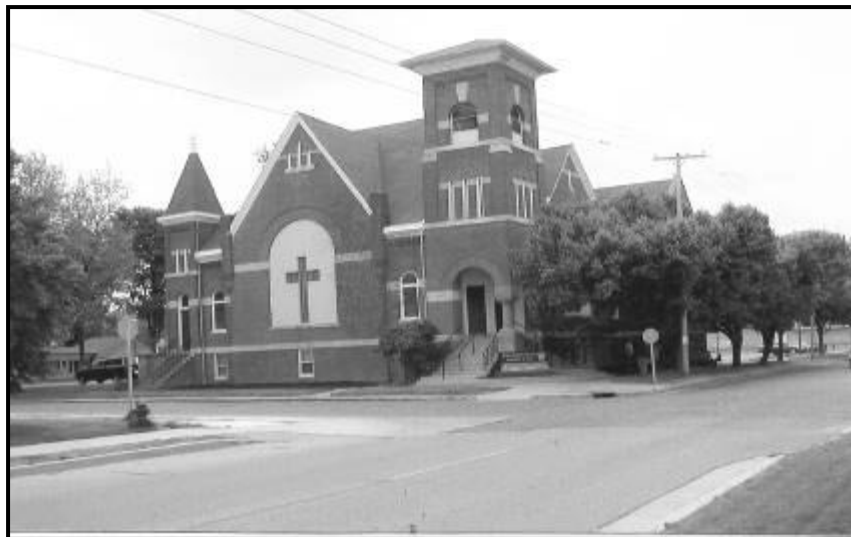
EAGLE MOUNTAIN ASSEMBLY OF GOD