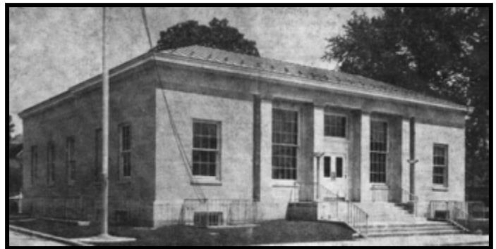
Tuscola Post Office in 1940.