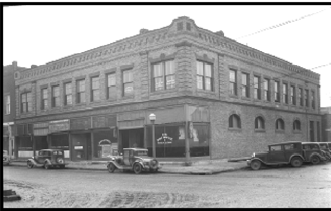
The Tuscola Post Office, located at the northeast corner of North Main Street and East North Central Avenue from 1933-1940.