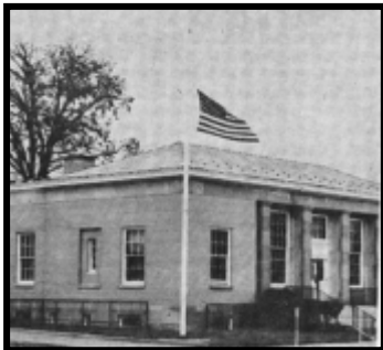
Flag at the post office flying at half staff after November 22, 1963, when President John F. Kennedy was assassinated in Dallas, Texas.

The Tuscola Journal , November 28, 1963.