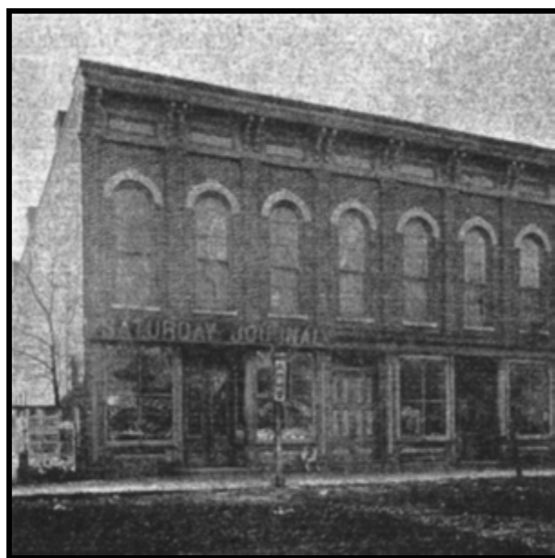
Saturday Journal Building on West South Central Avenue.