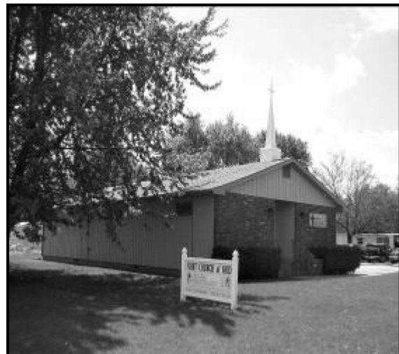
Church of God 821 E. Barker