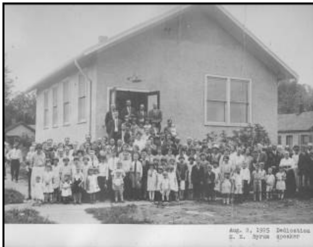
CHURCH OF GOD DEDICATION AUGUST 2, 1925 200 E. Pembroke