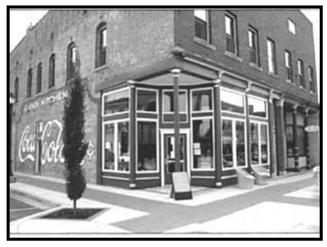
FLESOR'S CANDY KITCHEN