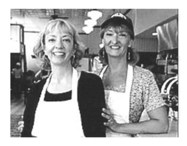
Reopened in 2003