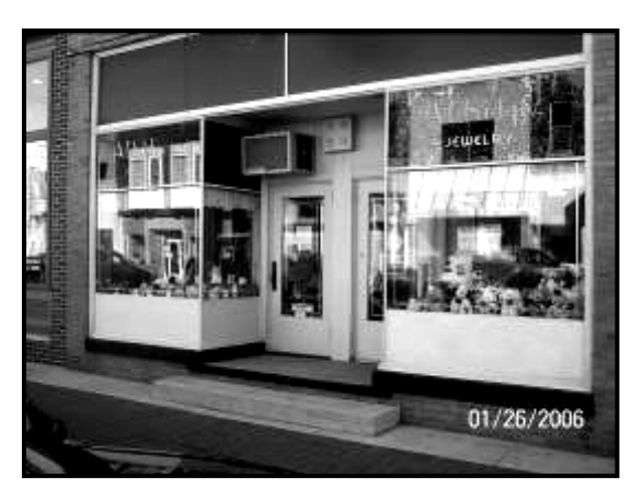
ALDRIDGES NOVELTIES 131 W. Sale St.