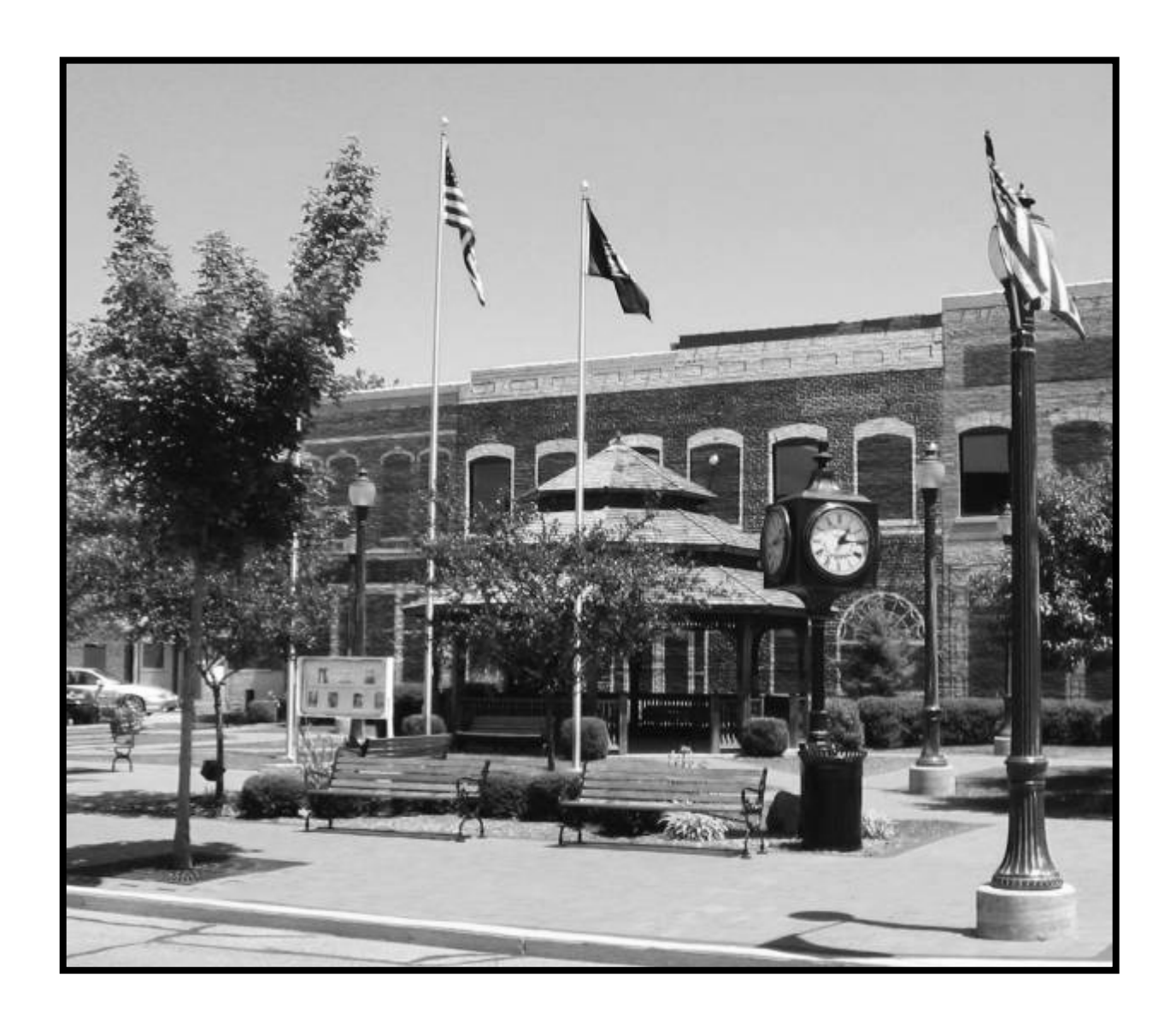
Festival Corner – Main and Sale Streets