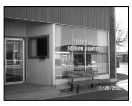
TUSCOLA SENIOR CENTER 133 W. Sale St.