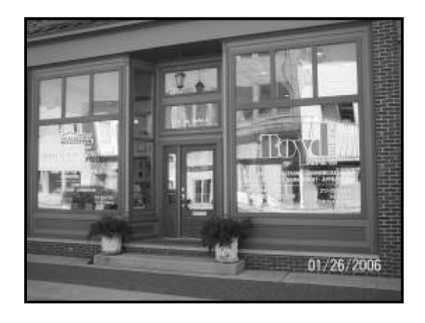
AMERICAN FAMILY INSURANCE 129 W. Sale St. BOYD REAL ESTATE – 129 W. Sale