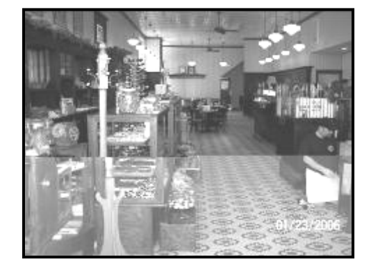
FLESOR'S CANDY KITCHEN