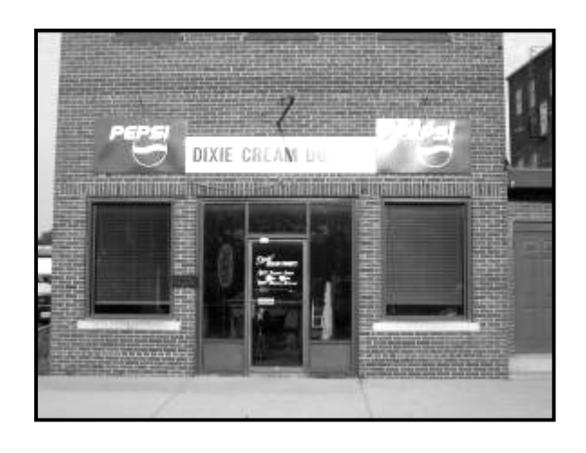
DIXIE CREAM DONUT SHOP 211 N. Parke St. Since 1971