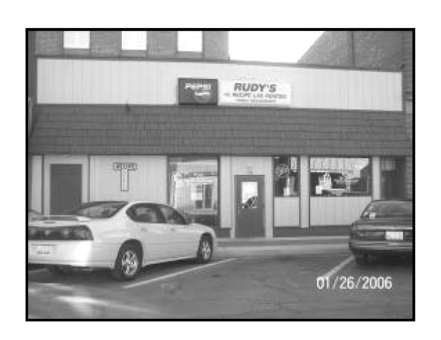
THE RECIPE LAS PENITAS RESTAURANT AND LOUNGE 125 W. Sale St.