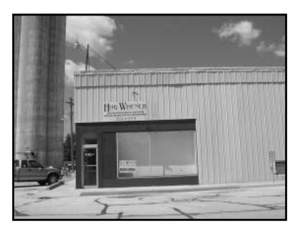
HOG WRENCH 200 N. Parke St. Motor Cycle Repair and Service