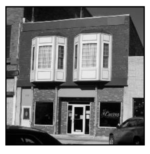
CURVES FOR WOMEN – 124 W. Sale St. Since July 2002