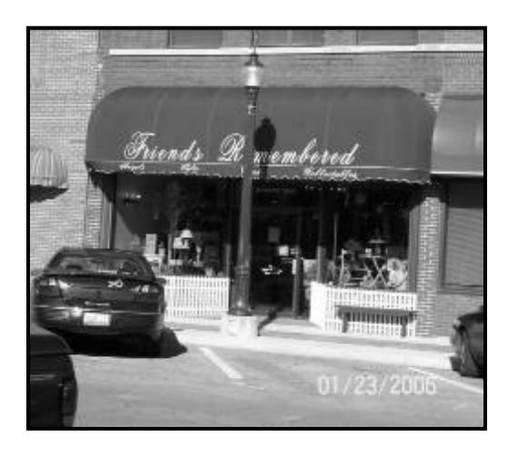
FRIENDS REMEMBERED GIFT SHOP