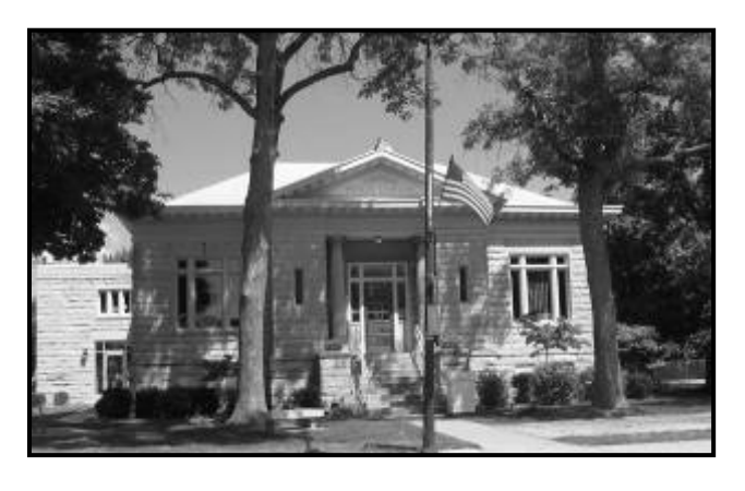
TUSCOLA PUBLIC LIBRARY 112 E. Sale St.