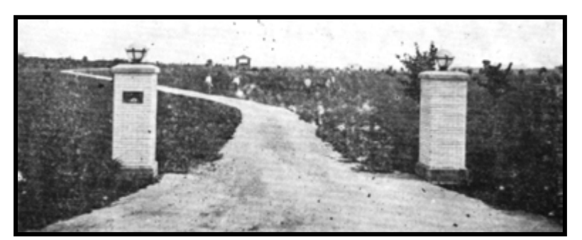
Entrance to Ervin Park - 1922

A swimming pool was added to the southwest end of the park in 1957, providing a fun place for area residents to cool off on hot summer days and for the Tuscola Torpedoes swim team to practice and hold swim meets. Ervin Park has four ball diamonds that are in use all summer by baseball teams (all ages) and softball teams (all ages). The park also provides tennis courts, basketball courts, soccer fields, a walking track, horseshoe pits, a volleyball court and plenty of playground equipment. A modern playground was built by volunteers in 1995, and makes an attractive addition to the south end of the park. Tuscola's Fourth of July Celebration is the best part of the summer activities every year. Festivities start in the park early in the day, with ballgames, mud volleyball, 3-on-3 basketball tournament, food vendors, music and is capped off with a spectacular fireworks display at dusk. With two pavilions and ample picnic tables, Ervin Park is the perfect gathering place for the citizens of Tuscola all summer long.