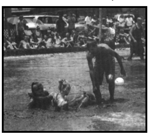
Mud volleyball tournament on the 4<sup>th</sup>. The Tuscola Review, July 11, 2006