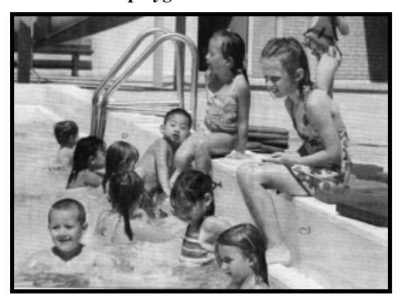
Children enjoying the swimming pool.