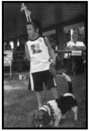
The Tuscola Review, July 11, 2006